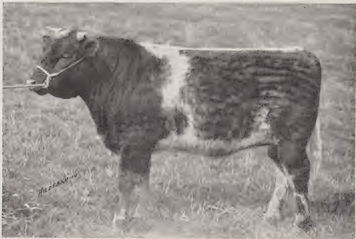
BUTTERFLY'S SULTAN 379870.